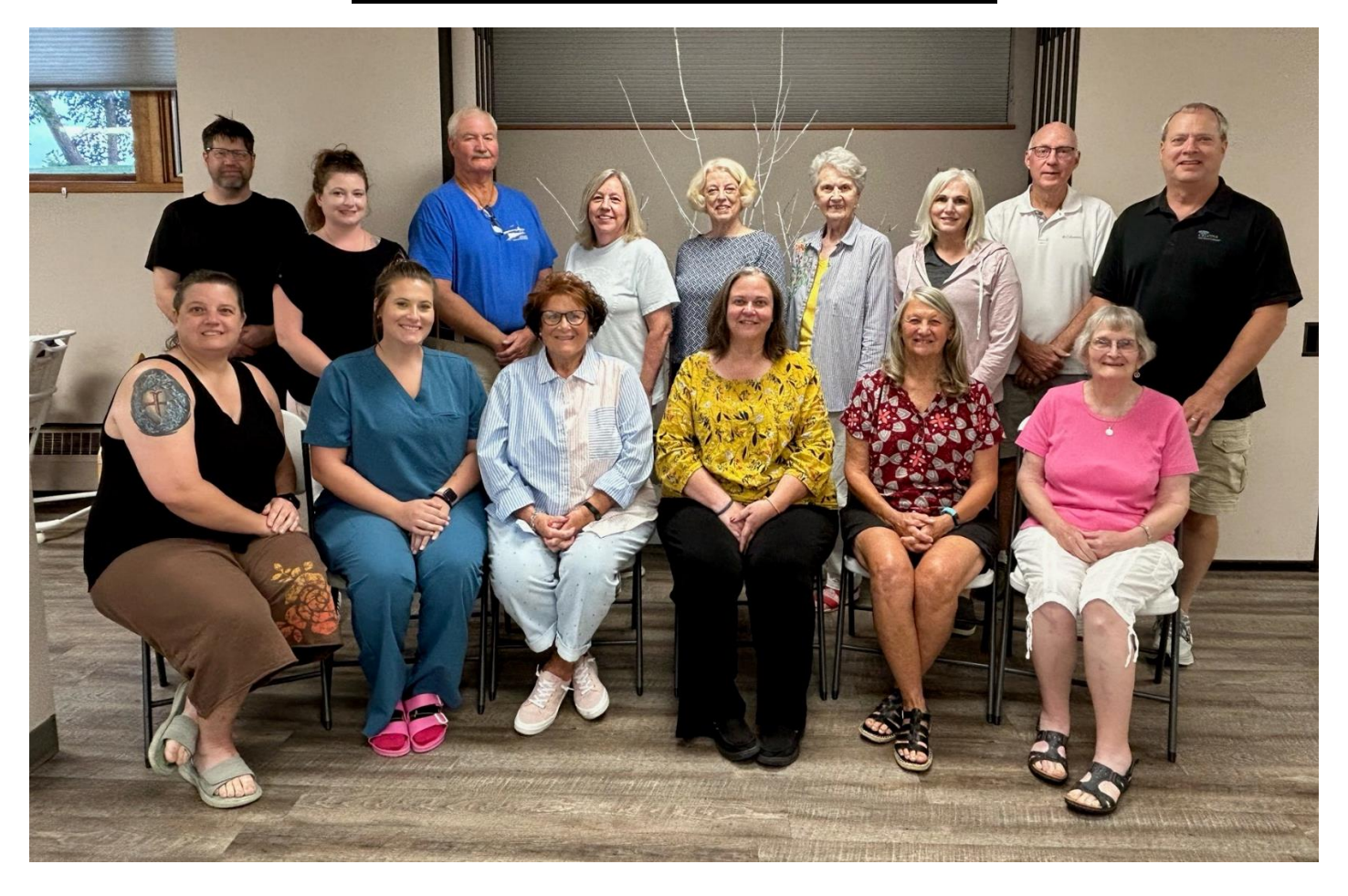
Our Savior's Council (names in red are new 2024 members)